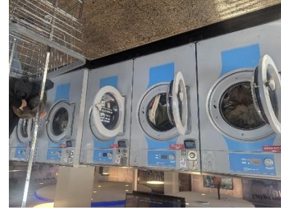
Tumble Wash Laundromat's 6 washers used in laundering the men's winter coats -