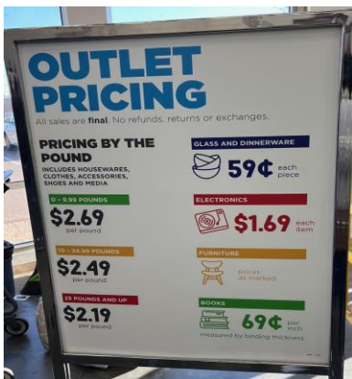
Goodwill Outlet Pricing by Pound -