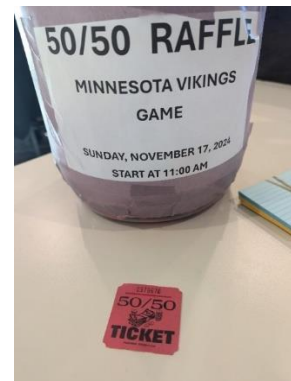
The winning ticket # 0979676